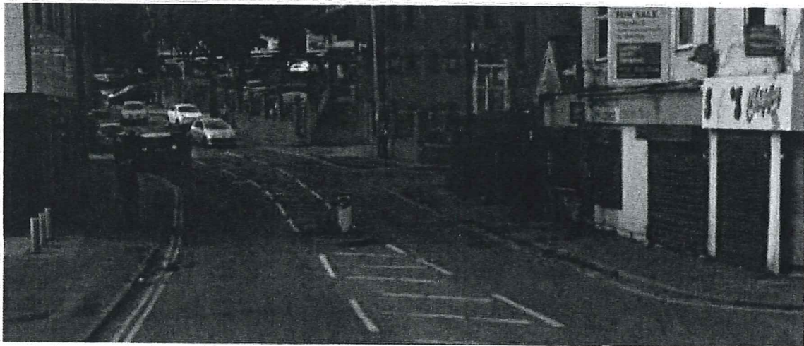
Street View Again shows the shop (yellow sign) and the Harnall Lifehouse opposite.